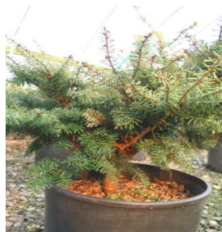
Workshop #5, The largest of the 5 trees.