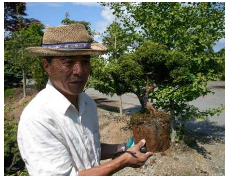
Workshops #6 and #9